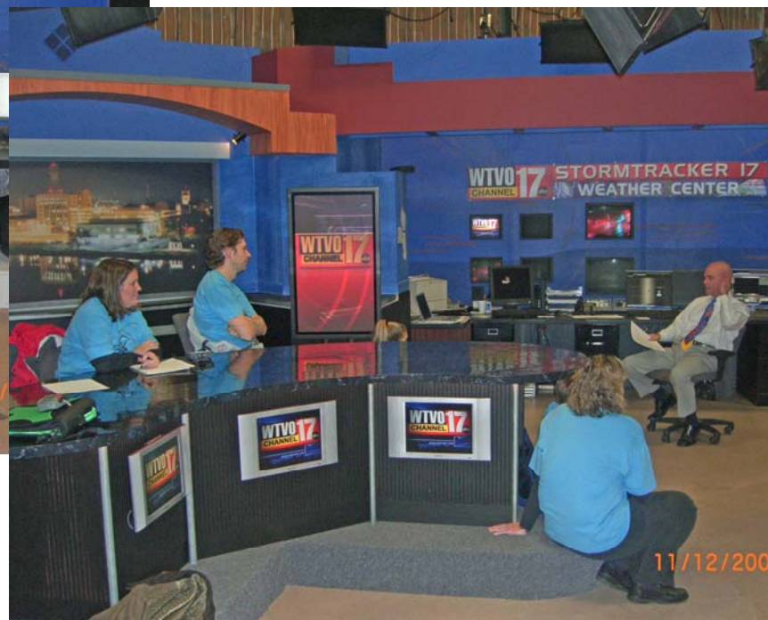
The team is asking questions